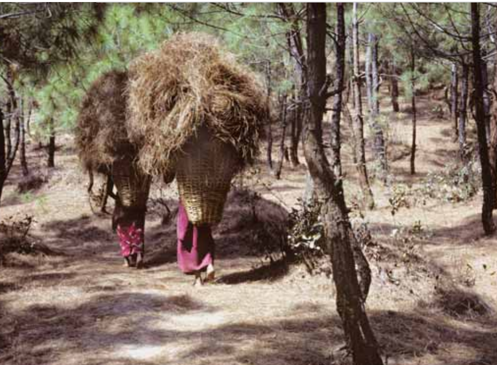
Women in Nepal are key users of forest resources, but Nepal's forest institutions are dominated by men. Efforts to promote change aiming for gender equality should not be limited to the project level: they must also take place at the level of organizations.

Important contributions in this regard are made by the “Learning Studies and Lessons from Asia”, which are based on six action research projects of the International Development Research Centre (IDRC). This is well illustrated by the Chinese example. Ever since China has liberated its economy and become a member of the World Trade Organisation, the country is experiencing deep-