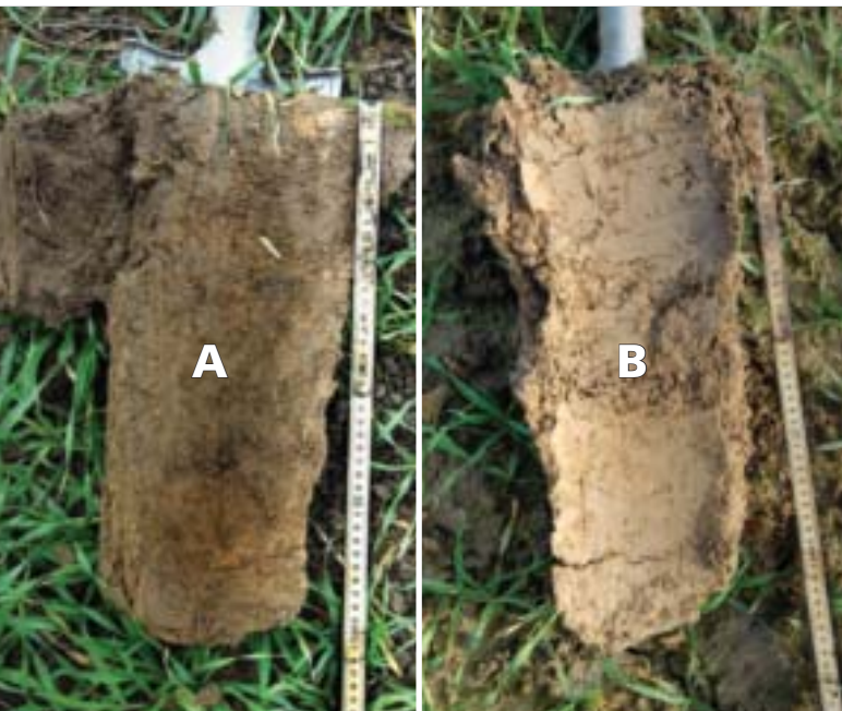
Seven years of applying no-tillage techniques has increased the organic matter in agriculture land considerably (A, darker soil) compared to the conventionally ploughed field (B).

But what potential do soils have for sequestering carbon dioxide? Carbon is constantly exchanged between the atmosphere and the soil: on the one hand, carbon is stored in the soil in the form of organic matter, and on the other hand, it is released into the atmosphere when the vegetation cover is removed and the topsoil is depleted through intensive soil tillage. Today around 1600 billion tons of carbon are stored in the soil, about three times the amount stored in the vegetation cover. However, soils could store substantially more carbon dioxide than they do today. Sustainable land management is key in this regard. Soil organic matter can be increased considerably by using sustainable cultivation methods such as, for example, organic farming, agroforestry, minimum tillage, green manuring, and mulching. Optimistic estimations indicate that 5–15% of carbon dioxide emissions from fossil fuels could be fixed in the soil each year. However, the fact that this store is limited, and the risk of carbon dioxide being released back into the atmosphere at a later stage, prohibit using these measures to replace efforts to reduce fossil carbon emissions. Enriching soil carbon can do no more and no less than complement reduction of fossil carbon emissions.