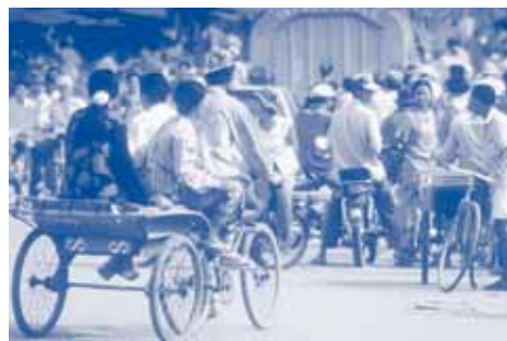
Population growth increases the pressure on natural resources. Street scene in Phnom Penh, Cambodia.

InfoResources Trends compiles personal assessments of predicted changes by experts from the realms of politics and science, as well as from implementing agencies of NGOs around the world, and it makes these assessments accessible to a broader professional public. It is published in English, French and Spanish. It is available free of charge and may be ordered in pdf-format, or as a print publication from the address below.